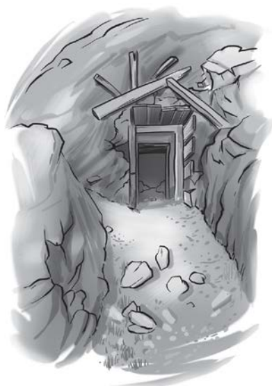
Old mine entrance

The new substance made by these reactions enters the surface water to become an environmental hazard.